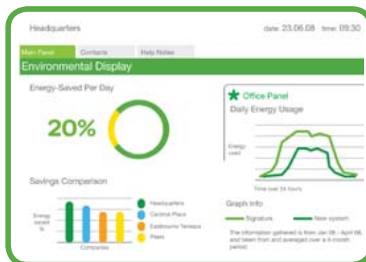
Typical ERM Dashboard

Customized reports are key to providing the right information to the right person at the right time. For example, the CFO may be concerned with total cost and carbon emissions, while the CFO may need